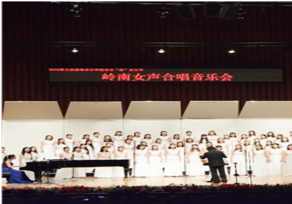
Picture 1 the Lingnan Women's Choir Concert