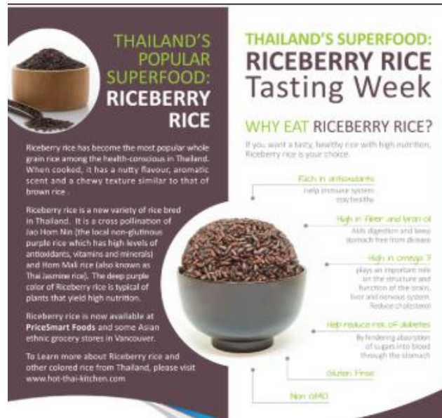
Figure 1 Benefits of Rice berry

With the agricultural development plan of Thailand, it is operated under the Committee on Agricultural Development and Cooperative Policy and Planning, which is in accordance with the provisions of the Agricultural Economics Act, BE 2522 (1979). The agricultural development plan will be specified to be consistent with the 12th National Economic and Social Development Plan (2017-2021), consisting of 4 strategies 1. Strengthen farmers and farmers' institutions 2. Increase the efficiency of agricultural product management throughout the supply chain 3. Increase the competitiveness of the agricultural sector with technology and innovation and 4. Management of agricultural and environmental resources with balance and Sustainable From the said agricultural development plan, the agricultural sector must adjust and strengthen the farmers' network and related agencies to keep up with the changing technology. For Thailand, the agricultural sector plays an important role in the country's economic system. Due to the large number of people involved in the production of food for the world, food security is a base for industrial and service sectors to generate income for the country as well as a way of life, wisdom and culture. For a long time Sustainable agricultural development is considered the heart of the country's economic and social development.