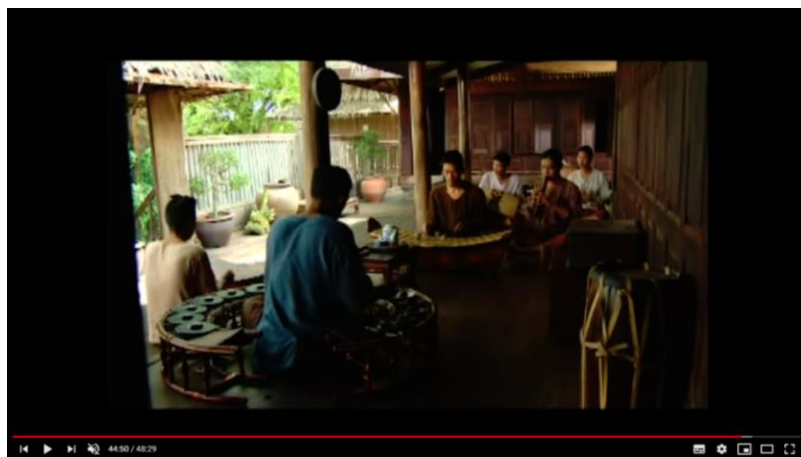
Fig 2 Studying Ranad (wood xylophone) ( http://www.youtube.com/Homrong , 2019)