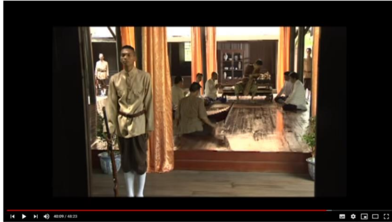
Fig 3 Audition of Ranad musician (wood xylophone musician) in the palace ( http://www.youtube.com/Homrong , 2019)