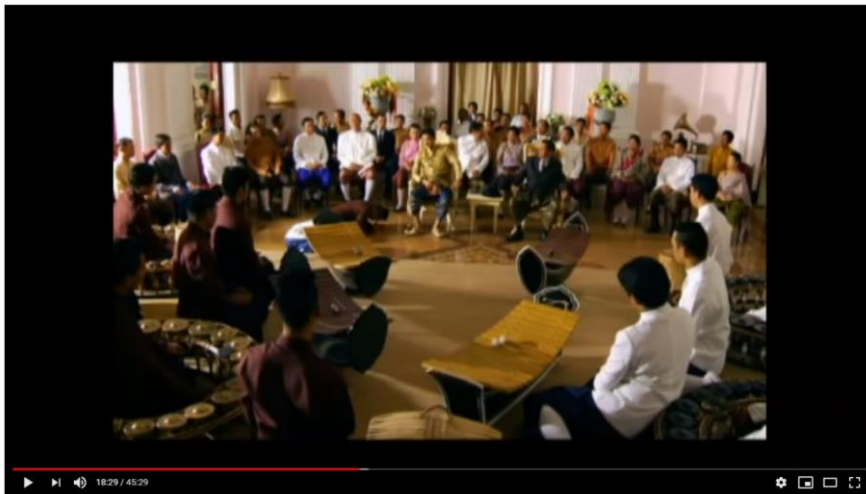
Fig 4 Thai Classical Music “Pipat” Contest in the palace ( http://www.youtube.com/Homrong , 2019)