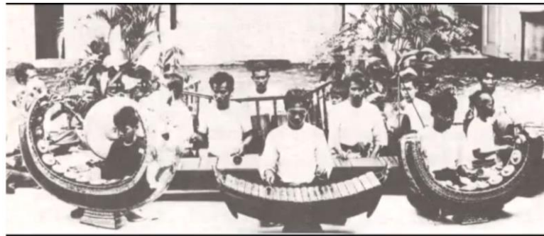
Fig. 1 Thai Tradition Music call “Wong Pipat” ( http://www.youtube.com/Homrong , 2019)