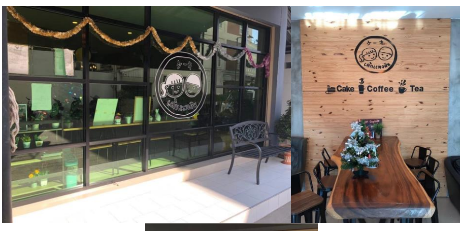
G T - A TO THE TOTAL WAS GIVEN