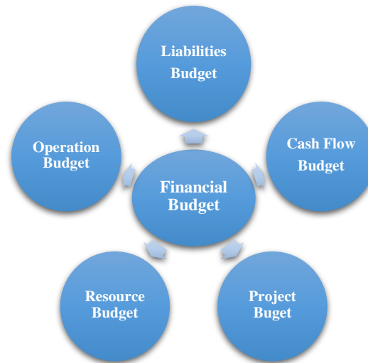
Figure 1 Financial Budget