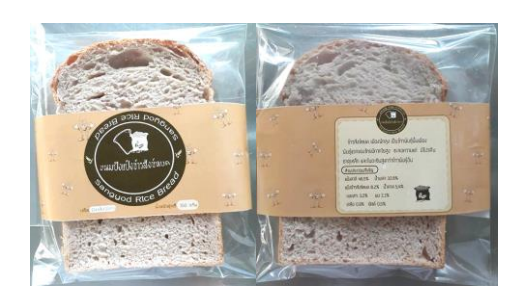
Figure 3 The product package of Sangyod rice bread

From Table 5, the results of the packaging characteristics of Sangyod rice bread according to the picture of package format, the findings were that overall picture, satisfaction level was at much ( \bar{x} = 3.83 , S.D. = .041) considering each aspect, satisfaction level was at the most level in every aspect the first rank was overall preference of the package ( \bar{x} = 3.90 , S.D. = .969) The next rank was symbol of the product ( \bar{x} = 3.87 , S.D. = .933) the Colour of package ( \bar{x} = 3.83 , S.D. = .874) The last rank was letter ( \bar{x} = 3.81 , S.D. = .954) respectively.