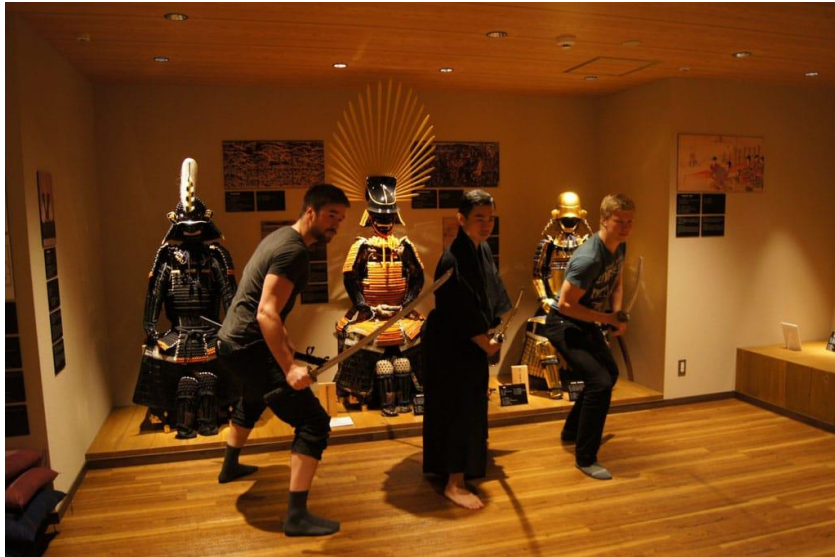
Fig. 2 Weapon Dance in Samurai Museum ( https://matcha-jp.com/th/1736 ), 2019.