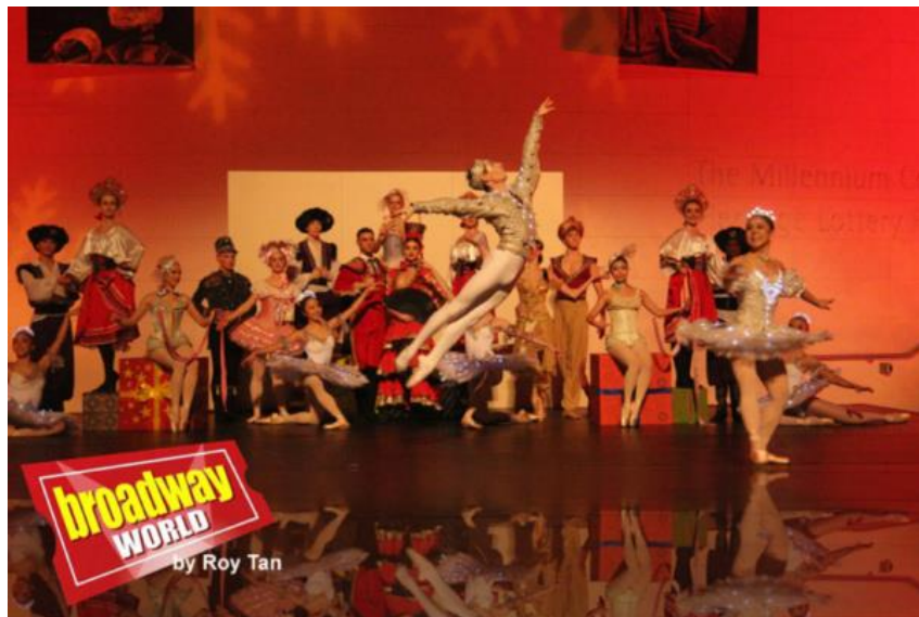
Fig. 3 performing arts in British Museum ( https://www.broadwayworld.com/westend/article/Photo-Flash-First-Look-at-Ballet-Centrals-THE-NUTCRACKER-at-the-British-Museum-20181205 ), 2019.