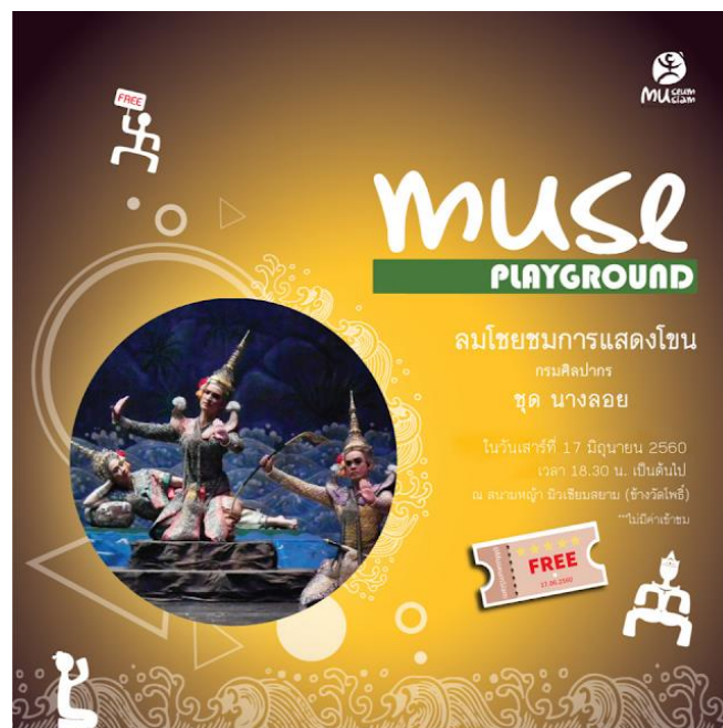
Fig. 1 Khon in Muse poster

( https://boxkao.blogspot.com/2017/06/blog-post_78.html ), 2019.